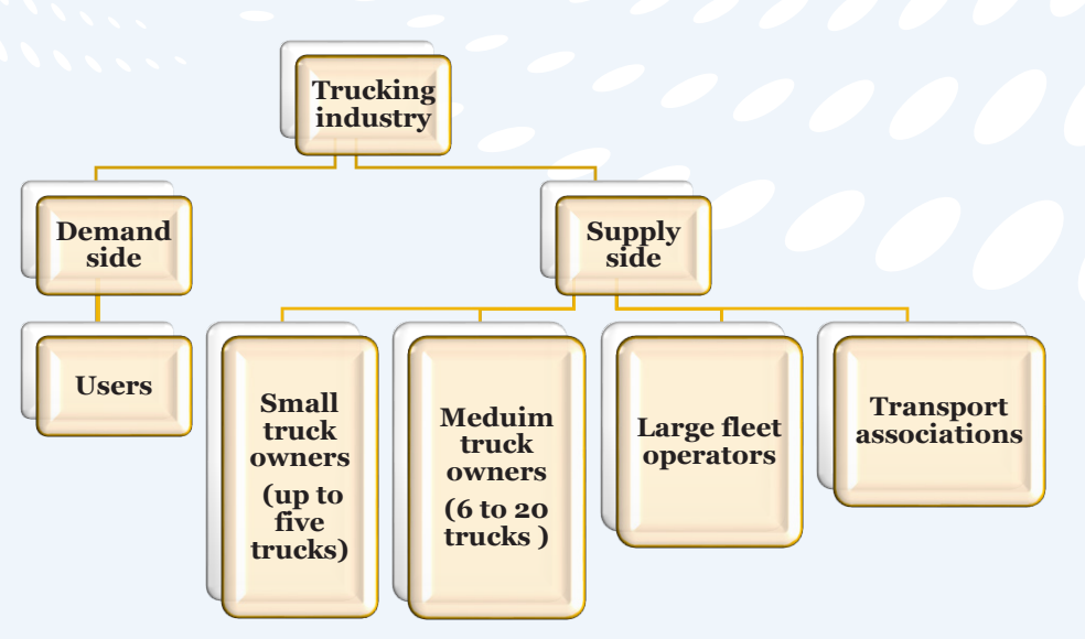
FIGURE 1. IDENTIFICATION OF STAKEHOLDERS IN TRUCKING INDUSTRY

International Institut Institute for Sustainable Development durable