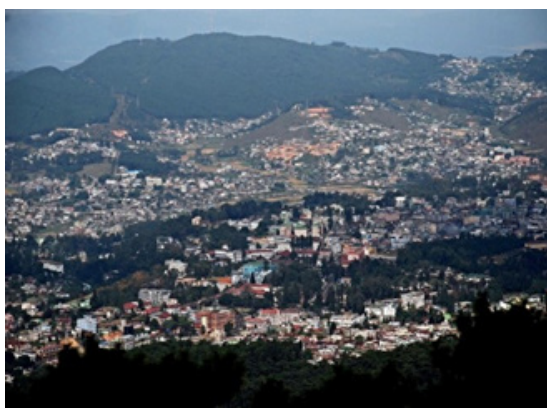
Fig2: Shillong City Overview