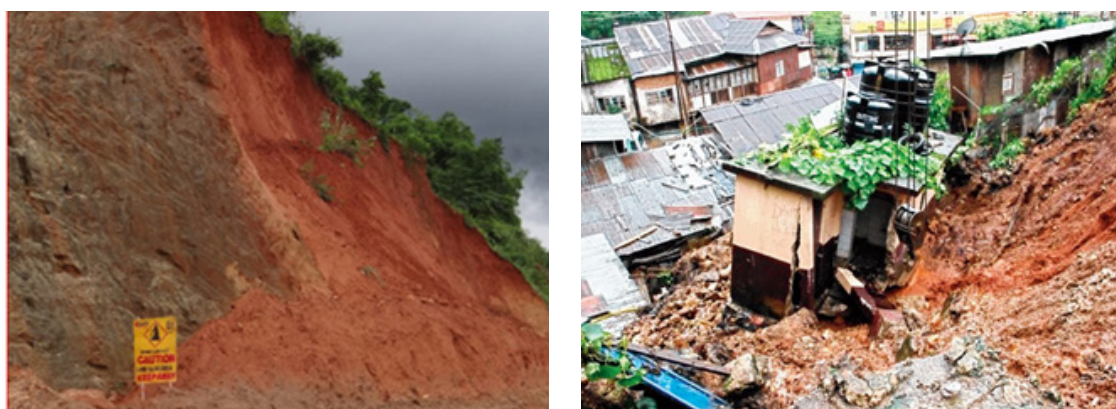
Fig4: Landslide occurrences in Shillong