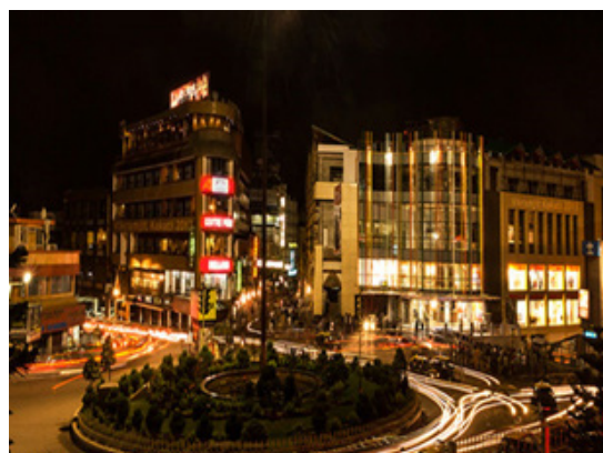
Fig3: Panorama of police bazar, Shillong Economic hub

The city is vulnerable to natural hazards like earthquake, landslide, heavy rainfall, floods etc., as well as man-made hazards like road accidents, fires, water scarcity due to rapid growth of urbanization and improper and uncontrolled construction.