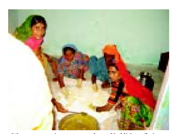
Women preparing soap powder at Vaddithar, Gujarat.

IRADe has been awarded the project titled Bio Energy to complement a development project in choosing to be consistent with the principles of ecology, equity and energy efficiency and thereby guarantee long term sustainability of programme" by Global Environment Facility in January 2007 to ensure access and assimilation of sustainable energy systems through the Village Energy Security Programme (VESP) of the Ministry of New and Renewable Energy (MNRE), in a way that could be replicated in other such communities. The project is being carried out in Vavdi (80 households) and Vaddithar (82 households) hamlets of Santalpur taluka of Patan district in Gujarat, India.