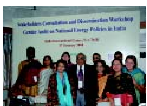
Gender Audit Team at the Workshop in Delhi.

policy makers, corporate representatives, NGOs, etc. The objective of the workshop was to bring together key stakeholders/ decision makers in the energy and related fields at the national level to make them aware of the tasks that need to be undertaken in the gender audit exercise. It was well attended by people who are involved in energy and gender related sectors both from the government departments and civil societies. The workshop was successful in meeting its objectives with the kind of quality discussion and suggestions model by the participants, which will help in successful implementation of the gender audit study.