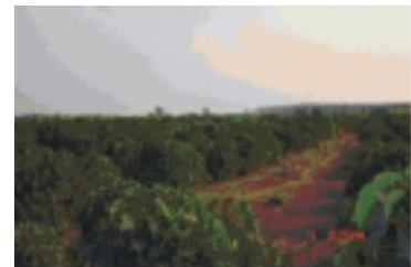
Biodiesel Plantation, Bhadoj